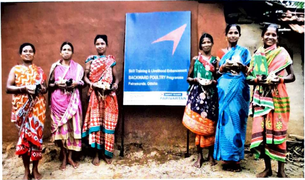
Backward Poultry Unit by WSHG